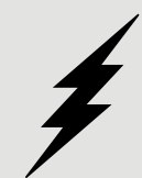
Electric C Line The original, made to go further.